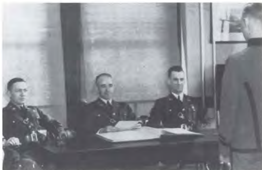
Lt. Col. Omar Bradley ( center ) and members of the Tactics Department at West Point, 1937. He taught cadets who would lead the Army in the 1960s and 1970s.

colonel to brigadier general, skipping the rank of colonel, and sent him to Fort Benning to command the Infantry School.