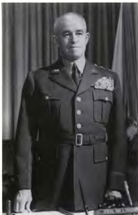
General of the Army Omar Bradley, first Chairman of the Joint Chiefs of Staff, August 1949. He served in this position until his retirement from military service in 1953.

programs for men whose only experience had been as members of the armed forces, established a program of loans for veterans, and administered a staggering growth in veterans insurance and disability pensions. Bradley was unable to accomplish everything he had hoped to do in his two-year tenure, but in the assessment of the press, he transformed “the medical service of the Veterans Administration from a national scandal to a model establishment.”